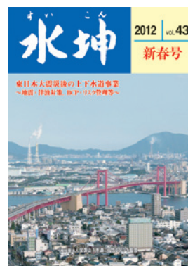
“ Suikon ” New Year 2012 edition

On Website: http://www.suikon.or.jp/suikon/index.html