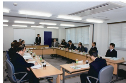
Technical Conference of Water Supply

On Website: http://www.suikon.or.jp/seika/zadankai_seika.html