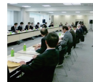
Conference of Exchange Opinions (17 th Jan., 2012)

We submitted a proposal of adopting QBS system instead of Quality and Cost Based Selection (QCBS) system to major business entities in order to ensure the quality of deliverables. (Announcement of official target price after the Tender)